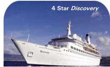
4 Star Discovery

A GREAT CRUISING EXPERIENCE Winner of 2010 Best Niche Cruise Line