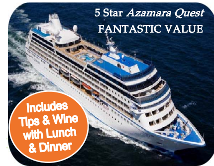
5 Star Azamara Quest FANTASTIC VALUE

Includes return air ex Bris, 1 night Singapore, 26 night cruise