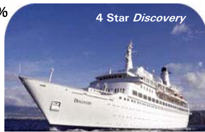
4 Star Discovery

Includes return air ex Brisbane, 1 night Singapore, 21 night cruise, onboard gratuities, port charges and taxes.