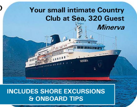
Your small intimate Country Club at Sea, 320 Guest Minerva

Includes return air ex Brisbane, 16 night cruise, 1 night accom Kensington/London, onboard gratuities, shore excursions, port charges and taxes.